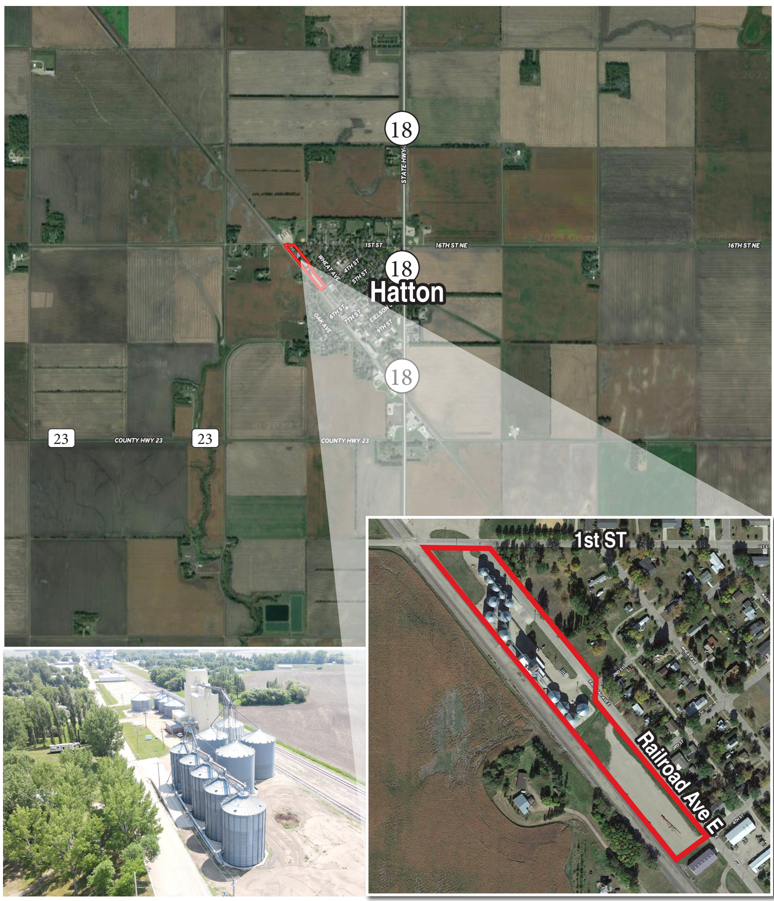
Address: 120 Railroad Ave. E, Hatton, ND 58240

Hatton, ND Grain Elevator Auction | Timed Online | Closes July 20, 2023 | SteffesGroup.com